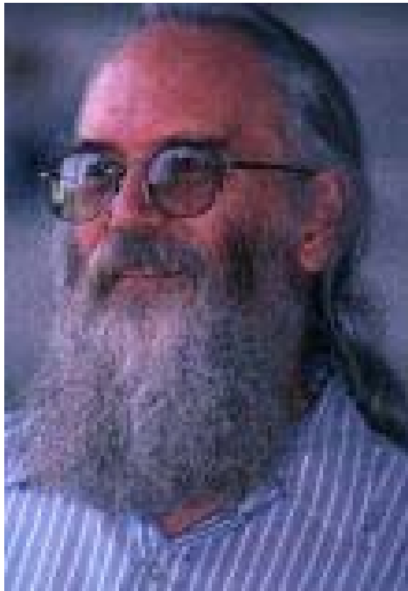
Jon Postel 1943-1998